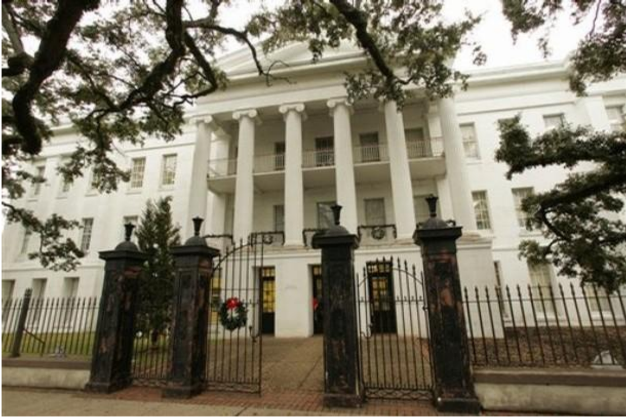
Figure 2.1: Barton Academy, Mobile, Alabama. 16

Despite the presence of large and commodious school buildings, the proverbial one-room schoolhouse likewise appeared across the Gulf South. Most school teachers did not enjoy Lucy Fisher's luck of having a generous benefactor offering to pay for school improvements, and few local or state governments took the progressive stance of the city of Mobile in helping to provide for such structures. The first school established in Alabama was described as "a log cabin with a door at one end, a huge fire place at the other, a window on each side closed by board shutters. The furniture consisted of puncheon benches and a shelf around the wall between the windows and the door. This shelf served as a depository for books and dinner buckets, also for a writing desk. On a shelf just outside