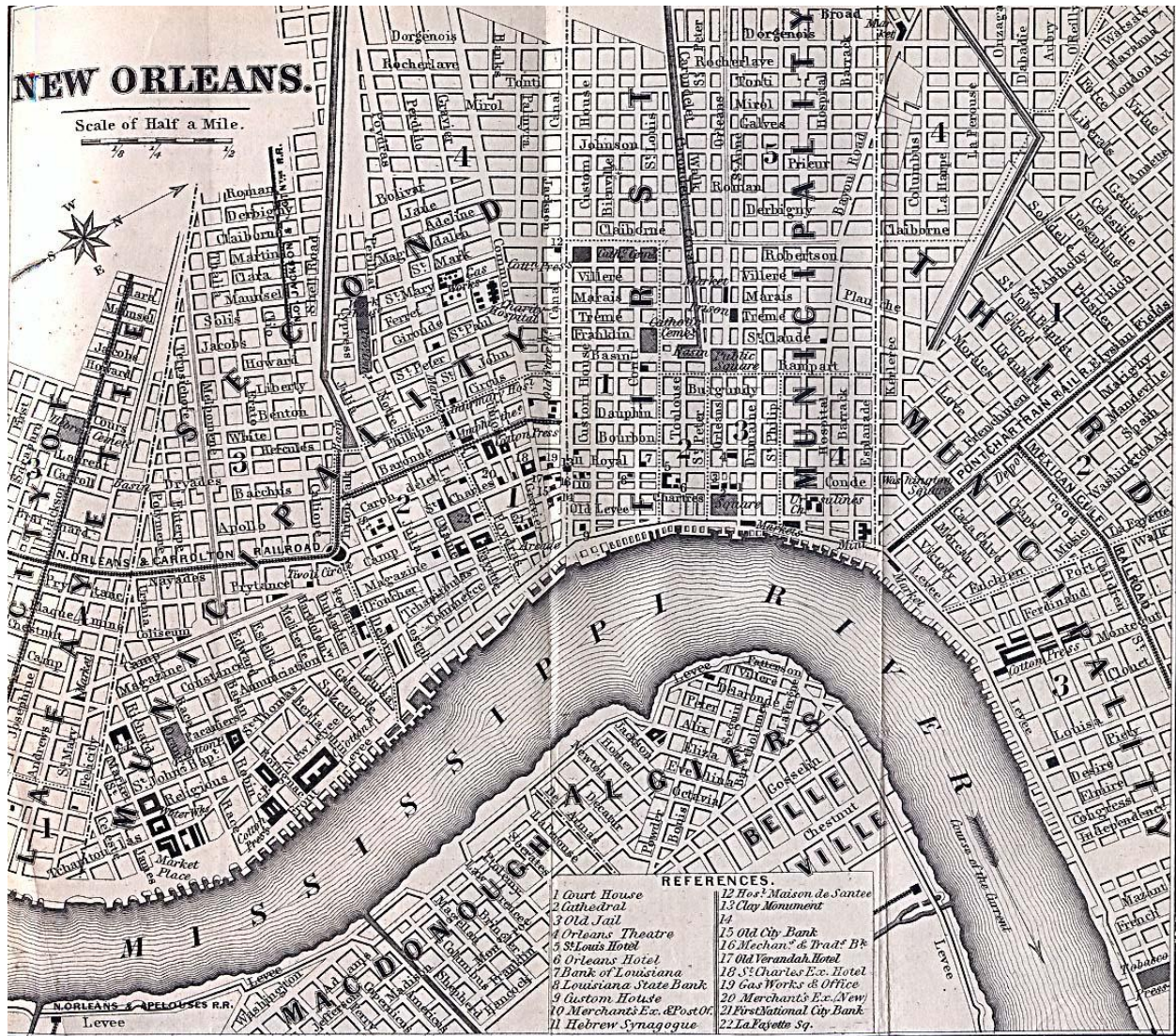
Figure 4.1: Map of New Orleans, showing municipal divisions. 26

system in the Crescent City. 27 Mann, secretary of the Massachusetts Board of Education, was known throughout the country for his advocacy of free common schools and was the acknowledged authority on the topic. Peters brought what he learned from Mann home to New Orleans where Joshua Baldwin, a police court judge, drafted a bill for the state