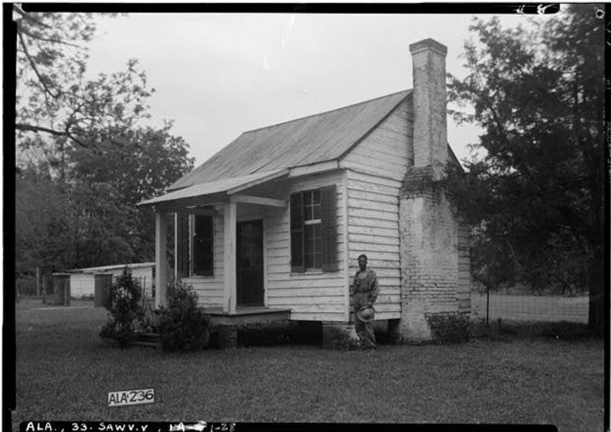
Figure 2.2: One-room schoolhouse in Greene County, Alabama. 18

the door the water bucket was placed, and on a nail beside it hung a long-handled gourd, which served as a common drinking cup.” 17